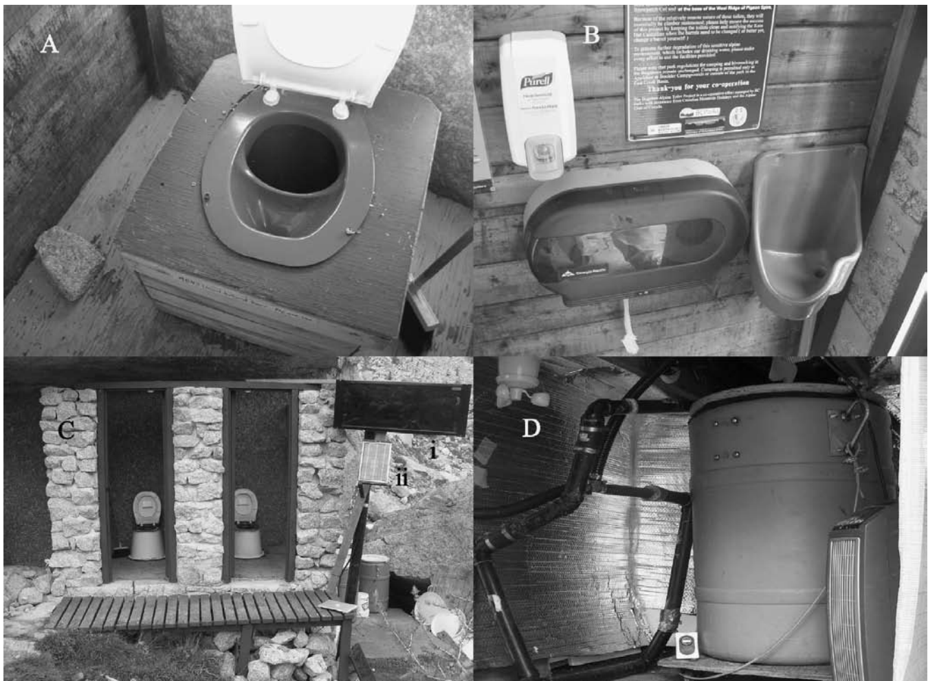
Figure 1 – Alternative toilet waste management treatments at Kain Hut, Bugaboo Park, BC Canada. (A) Urine diversion toilet seat. (B) Urinal with 1-inch braided drain pipe to collection barrel. (C) Lower toilets with UD12V solar hot-air panel (i) above a 5W PV panel (ii). (D) Upper Kain Hut toilet insulated basement, 110V heater, and 110CFM exhaust fan positioned around a 200 L plastic barrel with double garbage bags to collect solids.

We chose the Conrad Kain Hut, Bugaboo Provincial Park, British Columbia, elevation 2,100 m (6,890 ft) above sea level, as a site to test three